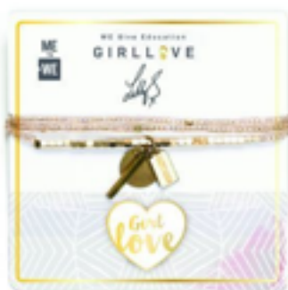
Lilly Singh GIRL LOVE

< For your buddy who needs a little push forward!