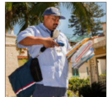
A U.S. Postal Service employee works hard to deliver your mail.

Remember that most of the day-to-day activity in the executive branch involves ordinary people doing the work that needs to be done: an FBI agent conducts an investigation, a soldier participates in training exercises, or a worker monitors a nuclear reactor at an energy plant. The executive branch needs people to answer phones, program computers, file papers, do scientific research, process mail, fly airplanes, and clean bathrooms. In fact, the federal government is the nation's largest employer, and most of those jobs are in the executive branch.