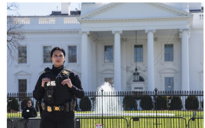
A Secret Service agent stands guard outside the White House.

We depend on many parts of the executive branch to keep us safe and to keep order. For example, the Department of Homeland Security (DHS) is responsible for protecting the United States against all kinds of threats. It includes agencies that deal with terrorism, natural disasters, and border protection. It also includes the Secret Service, whose agents protect the president and vice president and their families. Inside the DHS, the Federal Emergency Management Agency (FEMA) responds to natural disasters to help people get the help they need in an orderly way. The Coast Guard, also part of DHS, patrols our nation's coastlines to watch for threats and helps boats in distress.