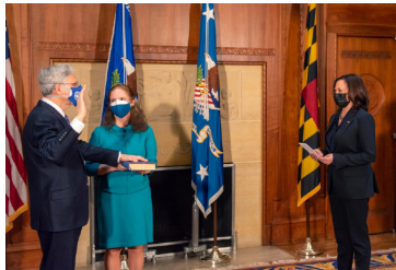
Vice President Kamala Harris ceremonially swearing in Attorney General Merrick Garland.