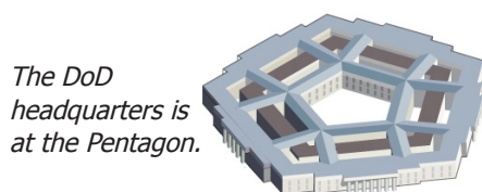
The DoD headquarters is at the Pentagon.

The Department of Defense (DoD) is the biggest department. It includes all the military departments such as the Army, Navy, and Air Force, as well as many other agencies. Together, all the parts of the Department of Defense work together to make sure our armed forces are prepared to protect our nation's security.