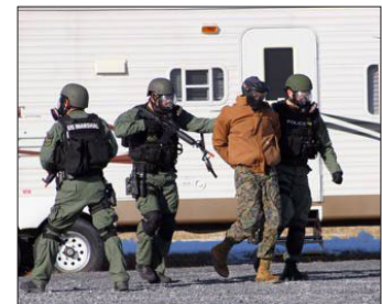
The U.S. Marshals Service is the oldest federal law enforcement agency. Marshals provide court security, hunt fugitives, and offer witness protection.