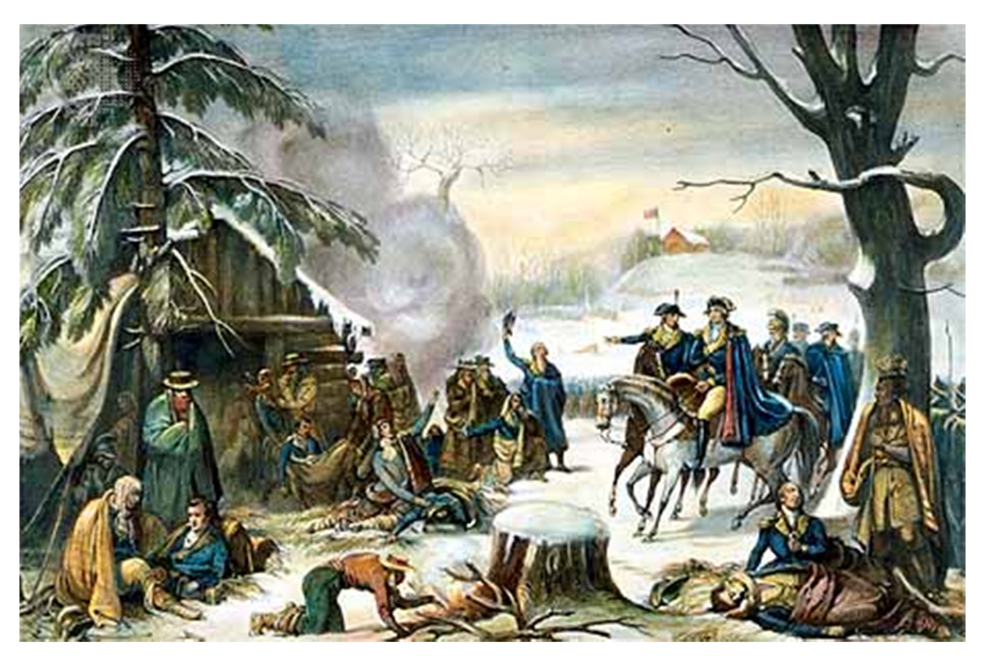
General George Washington and the Marquis de Lafayette surveying the troops camped at Valley Forge, Pennsylvania, in the winter of 1777–78, as depicted in a 19th-century lithograph.