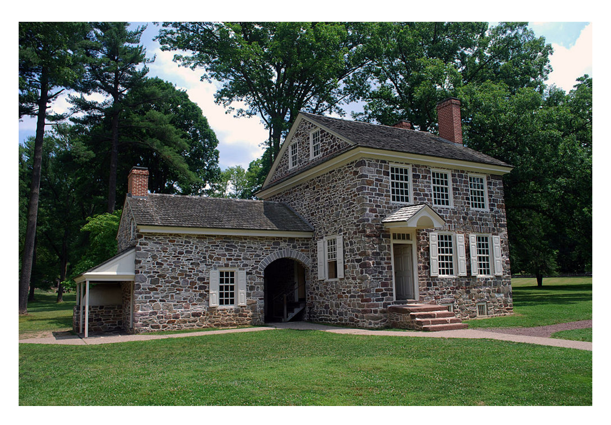
The headquarters of George Washington at Valley Forge, Pennsylvania http://en.wikipedia.org/wiki/File:George_Washington_HQ_Valley_Forge.jpg