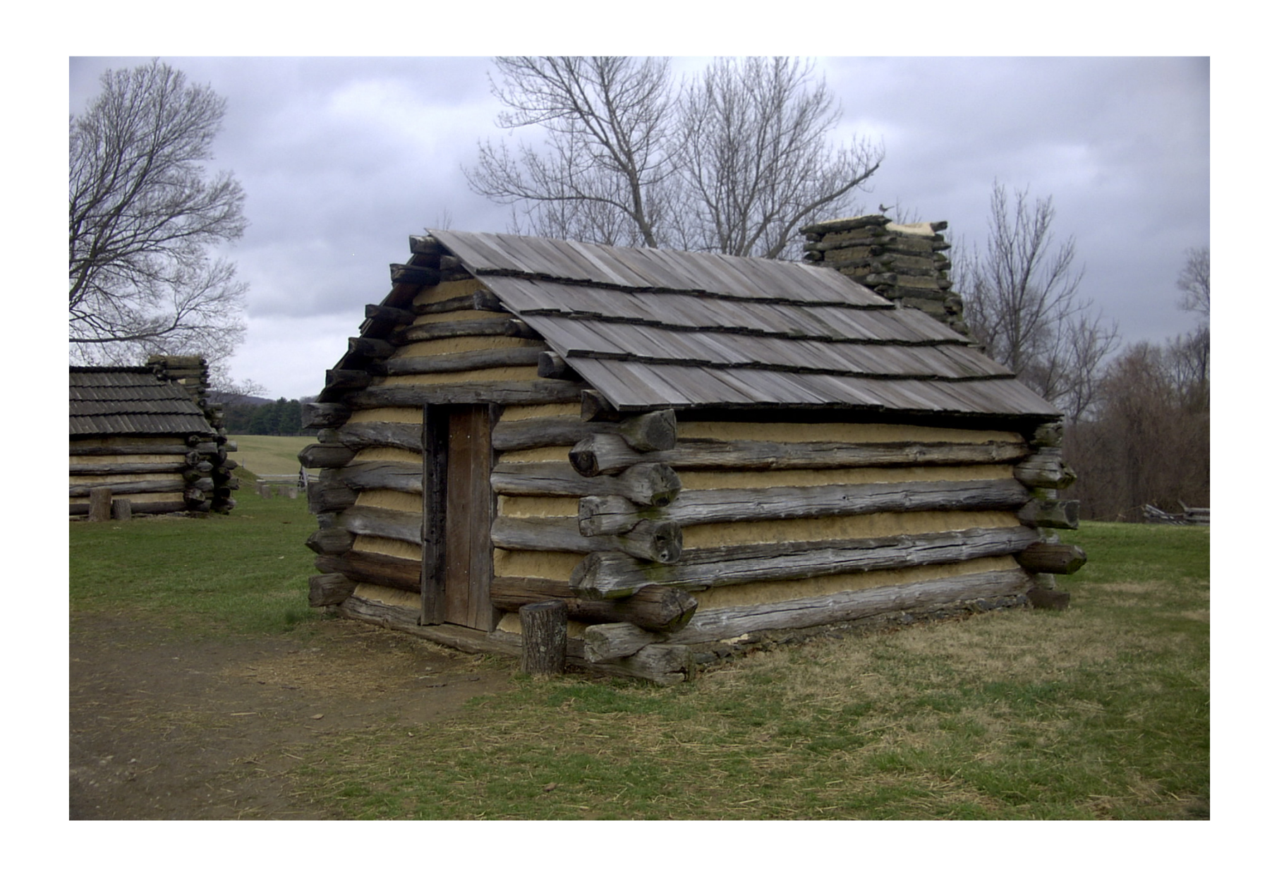
Soldier's Hut – Valley Forge http://slagshouseofstats.com/JimSatori/JimSatori.html