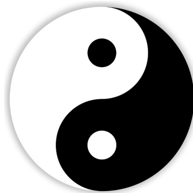
Illustration 3: The concept of Ying and Yang is a classic Chinese idea that nothing is entirely one thing... there is always a bit of the opposite included.

This leads us to the current way of describing light, the model known as Wave-Particle Duality .