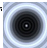
Illustration 1: The Poisson Spot.

Huygens was a strong believer in the existence of life on other planets. Towards the end of his life he wrote a book called Cosmostheoros in which he described animal and plant life on other planets in detail.