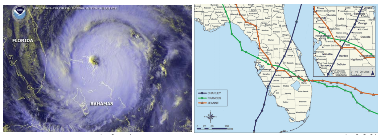
Hurricane Jeanne

Jeanne formed from a tropical wave off Africa on 7 September. The wave slowly strengthened to a tropical depression and then storm by 14 September. As Jeanne moved over Haiti, the heavy rains caused mudslides that claimed the lives of 3,000 people and washed away 200,000 homes. In the U.S. 4 deaths were directly caused by Jeanne along with property losses of 6.9 billion dollars. That year, Jeanne was one of three hurricanes to cross central Florida within one month.