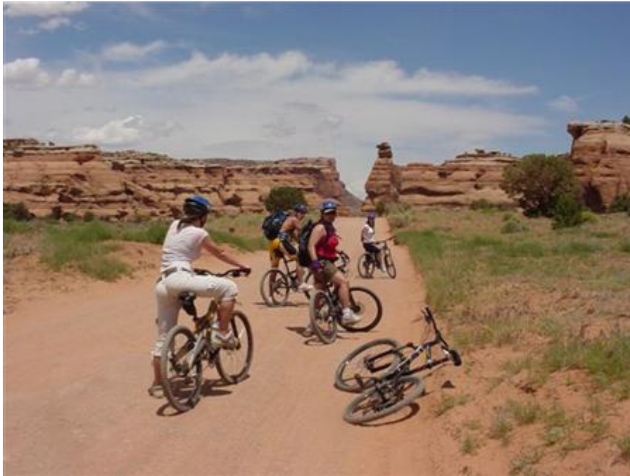
Photo club near the Gooseneck Overlook On the Shafer Trail