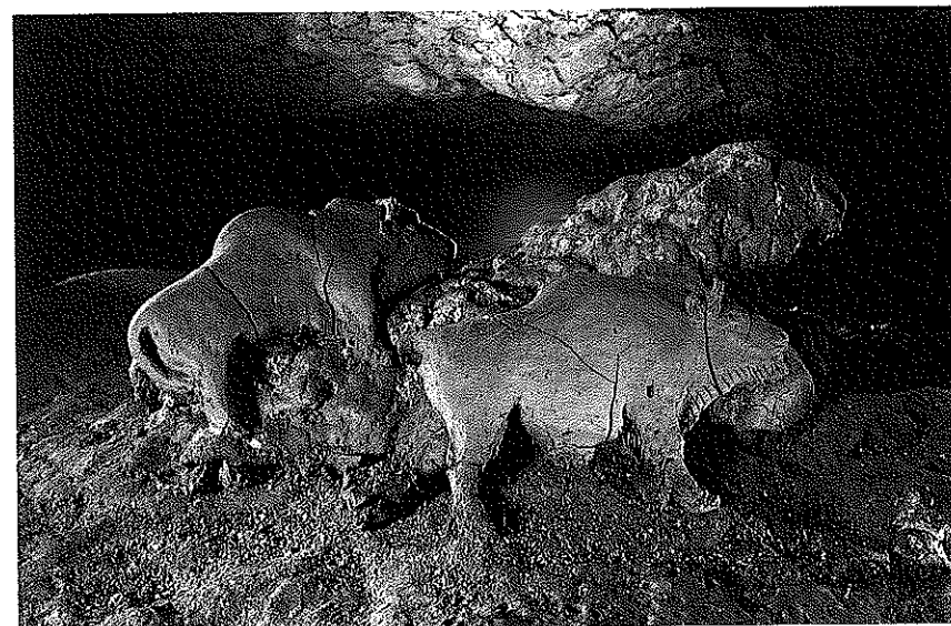
These clay sculptures may offer clues about the people who made them and why they made them.

Scientists have two main ideas about why these sculptures were created. One is that the sculptures showed that the cave belonged to a certain clan. The other idea is that they were used in an important ceremony that was held deep inside the cave. It might have been a coming-of-age ceremony to show that a child had become an adult. One clue that supports this idea is that footprints of young people have been found near the sculptures.