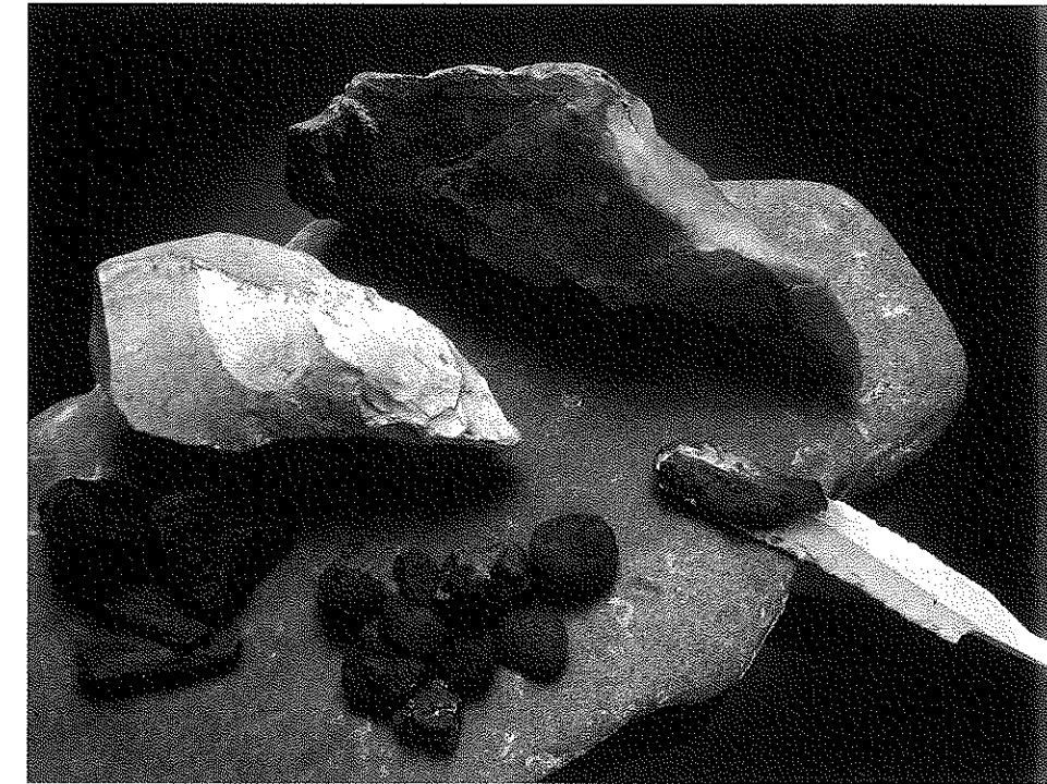
Cave artists used tools made of sharpened stones to sculpt and engrave objects and cave walls.

You've already seen how prehistoric artists engraved some of their art. For painting, they might have used brushes made of moss, fur, or human hair. They may also have blown paint through hollow bird bones to create softer textures, such as shaggy winter coats on horses.