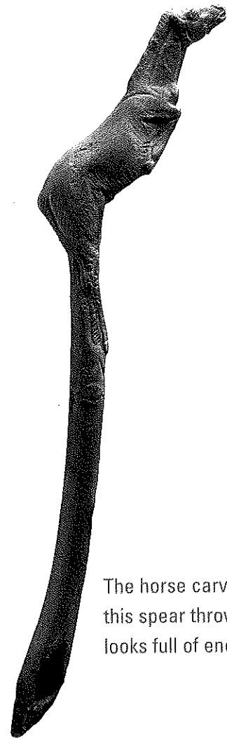
The horse carved on this spear thrower looks full of energy.